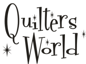
Toowoomba, Queensland Founding Sponsor