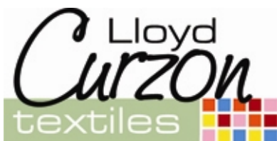
Lloyd Curzon Textiles South Australia Founding Sponsor