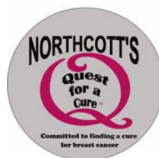
Northcott Silk Canada Founding Sponsor